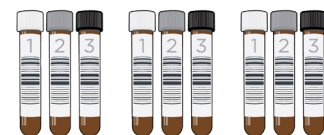
Corresponding Competitor Immunoassay Products